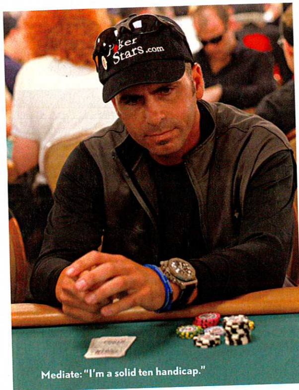
Mediate: "I'm a solid ten handicap."